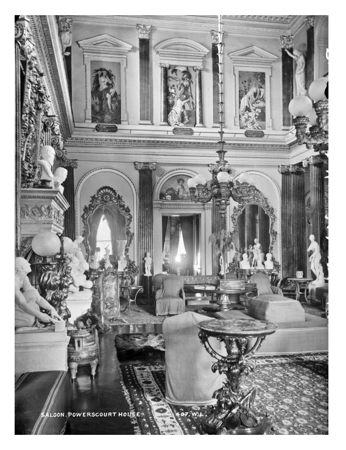
Fig. 4: The Saloon, Powerscourt House, Co. Wicklow. ca. 1865–1903. Ref. No. L ROY 00406.

Wingfield also had a large tripod enameled censer, which he kept in the majestic ball-room, or "saloon". This was an immense space, decorated in a princely Italian baroque style, where George IV (1762–1830) had been received in 1821. A photograph of the saloon, which Wingfield included in his volume, shows the vessel on the floor next to a massive stone chimneypiece, modeled for the collector on that in the Sala della Bussola at the Palazzo Ducale, Venice. Nearby are the skins of a mother leopard and her cubs, shot by himself. (Fig. 4) In this manner, men of his day often combined trophies of hunting and war. The vessel is a covered tripod ding censer with cabriole legs and archaistic dragon scrolls that date it to the Qianlong period. The splendid loot made an impression on visitors, for a reporter who visited in 1899 wrote "not a few of the Oriental ornaments were looted from the Summer Palace at Pekin". 32