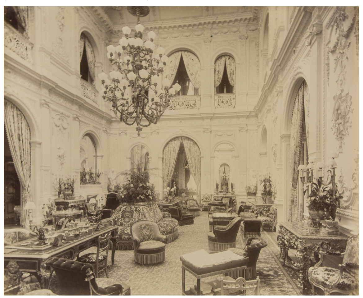
Fig. 5: The Salon at Halton House, Buckinghamshire. Sepia plate by S. G. Payne. Plate 7 from the photograph album "A de R Halton". File No. 000/880/20/1. © Rothschild Archive London

well-upholstered salon at Halton House, often used for entertaining. (Fig. 5) It seems Rothschild thought, like Powerscourt, that these vessels were splendid and sturdy enough to enhance his festive assemblies. Le Goût Rothschild had earlier embraced Asian porcelains in ormolu mounts and the display of cloisonné continued this tradition on the grand scale of the nineteenth century.