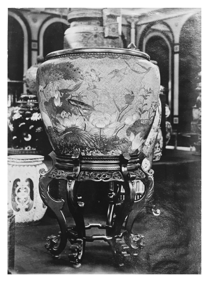
Fig. 2: Undated photograph of porcelain and cloisonné in the Alfred Morrison collection. Fonthill Archive, Wiltshire, File No. F-2-1143.

death describes the first piece as "A large circular centre cistern to match the above [the ice chests now in the Saloon] on gilt ormolu cabriole feet on carved wood base in imitation of rock work and serpent, open work brass cover with horn Monsters". The others are recorded as a "Pair of large square Chinese cloisonné enamel caskets and covers surmounted [by] gilt ormolu kylins on gilt ormolu feet, mask head and ring side handles – height 34 inches each."<sup>24</sup> These are similar to a pair of censers taken by the French army in 1860.<sup>25</sup>