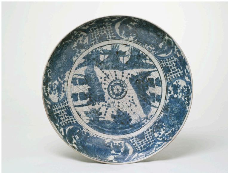
Fig. 7: Dish with landscape, South-China, porcelain c. 1600, porcelain and cobalt blue pigment under glaze, d. 45 cm Leeuwarden, Prinsessehof National Museum of Ceramics, GRV 1926-016

Although collectors do not always openly report all the relevant facts in their writings (not even in their personal notes), there is ample evidence that political circumstance, manipulations of local sellers and middlemen had a big influence on the collecting practices. Western collectors were strangers in the countries where they operated, so they needed at least some local support. 42