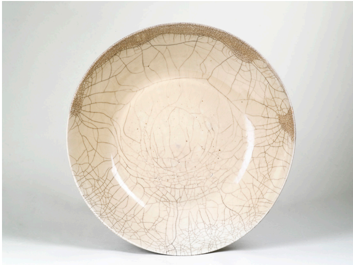
Fig. 6: Dish with white crackled glaze, Zhangzhou (China), c. 1600, porcelain, d. 48.5 cm Leeuwarden, Princessehof National Museum of Ceramics, GRV 1940-029