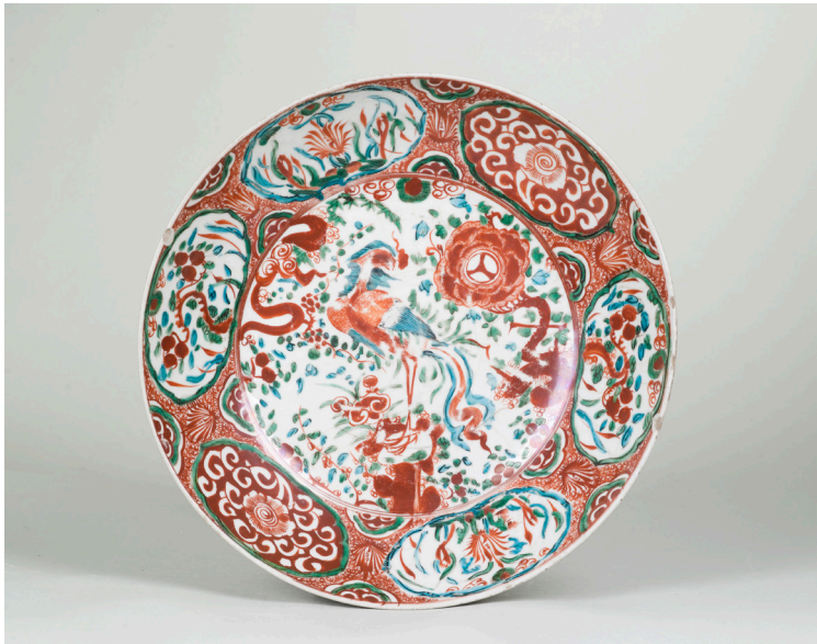
Fig. 8. Dish with phoenix design, South-China, c. 1600, porcelain, d. 37.5 cm Leeuwarden, Prinsessehof National Museum of Ceramics, GRV 1929-060

Van der Meulen and Verbeek, although at first glance two very different collectors, were products of their time. They started collecting in a period when the Dutch East Indies became increasingly absorbed into Dutch nation-building, and Indonesian cultural and material heritage were appropriated by the Dutch into their private collections and museums. In this article their collecting histories served as primary examples to ascertain why and moreover how Asian ceramics were acquired in Indonesia. There are many similar collecting histories to be told in relation to the Prinsessehof Museum, for example with regard to Hendrik R.A. Muller (1903-1979) and Anna Resink-Wilkens (1880-1945).