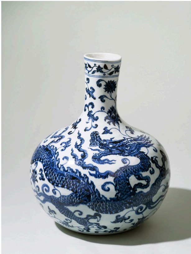
Fig.1: Blue-and-white vase with a design of a three-clawed dragon, Jingdezhen (China), Yongle period (1403-1424), porcelain and cobalt blue pigment under glaze, h. 43 cm / w. 33 cm