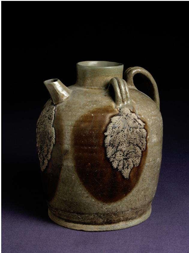
Fig. 4: Ewer with applied decoration, Tongguan kilns, Hunan (China), Tang dynasty (618-907), stoneware painted with green and brown under glaze, h. 19.8 cm / d. 16.5 cm

zine of 1910 by Johan E. Jasper (1874-1945), Control Officer for Internal Affairs at Soerabaja. 27 He remarked how antiquarians were able to buy considerable quantities of this porcelain in remote villages. In addition he mentions that in the Celebes this type of ceramics was found in graves and that martaban jars were held in high esteem by the Dayak population on Borneo. On Java people attached spiritual power to early Chinese ceramics. They were kept as relics and believed to contain healing powers when used as