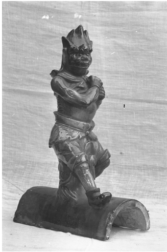
Fig. 10: "Devil with clenched fists" roof rider

On 25 October 1933, the day of the confiscation of the villa and its contents, Robert Diels, the president of the Berlin Gestapo wrote: "The material already in the house will be used for an exhibition of cultural-Bolshevik conspiracy". 18