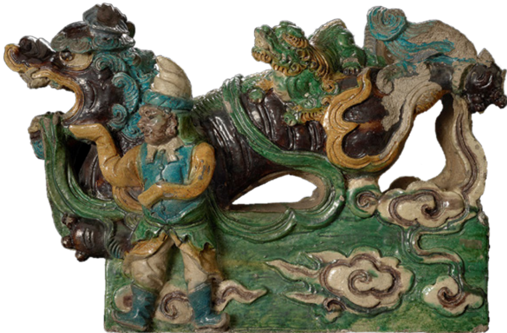
Fig. 7: Roof rider “Dragon with a guide”