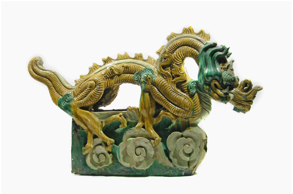
Fig. 8: The huge yellow dragon measuring 102 cm in length

Applied Arts: A collection of valuable Japanese sword guards (Tsuba), about 300 pieces / Japanese lacquerware, 80 – 100 pieces / Chinese snuff bottles, 100 pieces / Chinese deities carved in amber, 3 pieces / Sceptres for Mandarins, 3 pieces / Chinese carpets, 9 pieces / Chinese temple curtain, 18th century, 3 x 4 metres / Chinese embroideries, 17th and 18th centuries (Imperial Coats etc.), a very large collection / Japanese screens, 17th and 18th centuries (very precious), 5 pieces / Chinese faience and stoneware vessels, 9th century / Chinese embroideries, 17th and 18th century (Imperial Coats etc.) - 17th century, ca. 100 pieces / Chinese porcelain, plates, vessels and figural sculptures, 15th - 18th centuries, several 100 pieces / Early Japanese swords and daggers in lacquer, bronze and ivory sheath, 10 pieces / Japanese sword ornaments, 17th and 18th centuries, large collection / Objects made of jade and rock crystal, Chinese, approx. 10 pieces. 10