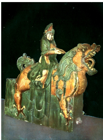
Fig. 12: “Rider with a sacrificial bowl on a mythical creature” roof rider

mainly commissioned by the Dorotheum auction house in Vienna. 26 In October 1937, Anton Exner bought nineteen objects from the Fuchs collection, according to the annotated Lepke catalogue. The provenance team of the MAK especially welcomed the discovery