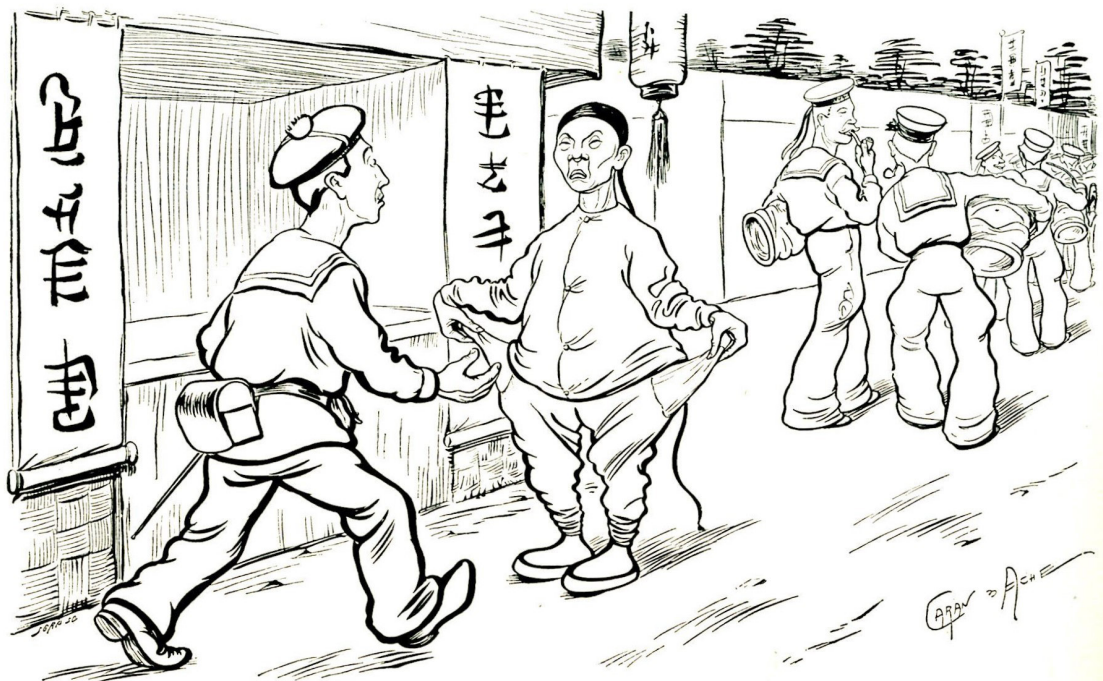
Frankreich in China. Der Chinese: Zu spät! ... ich bin längst ausgebeutelt!

Despite his political views, Fuchs built up his own collection of artefacts from China. His enthusiasm as a collector mattered more to him than the ethics of handling looted art. In his book “Dachreiter,” he refers to this dilemma, but continued to buy objects that had been fixtures of temples. 5