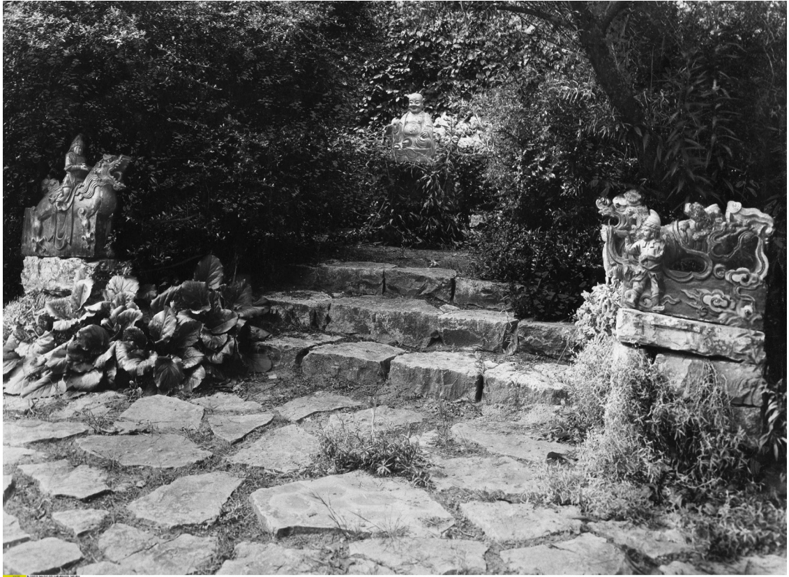
Fig. 6: The Chinese Garden of the Fuchs villa designed by Karl Foerster, Potsdam. The two Chinese roof riders and the Budai had been sourced in Vienna, Berlin and Stuttgart.