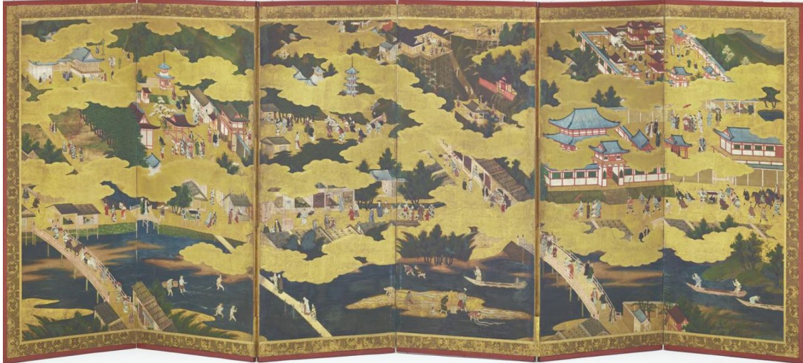
Fig. 11: Paravent with six panels, ink, colours and gold on paper, depicting the Temples of Kyoto