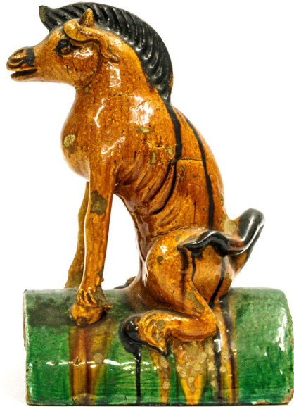
Fig. 9: “Mongolian Pony” roof rider

When reading his book on Chinese roof riders, a leitmotiv of the collector becomes apparent. As he put it, “this is nameless folk art. There is no book of heroes that bears witness to its creators”. 14