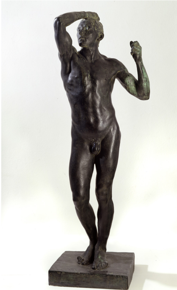
Fig. 3: Auguste Rodin, The Age of Bronze , 1875/76. Staatliche Museen zu Berlin, Nationalgalerie.

Shade's Spring of Love . 42 In his assessment to argue the dispensability of these works, Brauner stated that they were all relatively early acquisitions by the National Gallery, which held in all cases four or five other works by the same artists, so that the loss would not be severely felt.