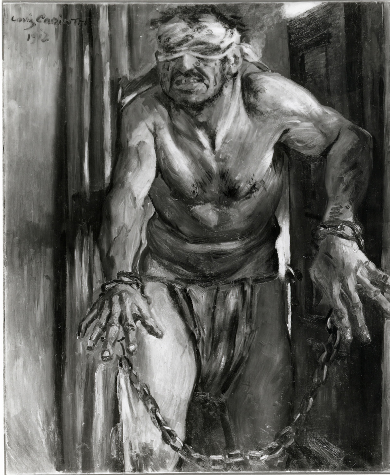
Fig. 1: Lovis Corinth, Samson Blinded, 1912, oil on canvas, inv. no. A III 668.