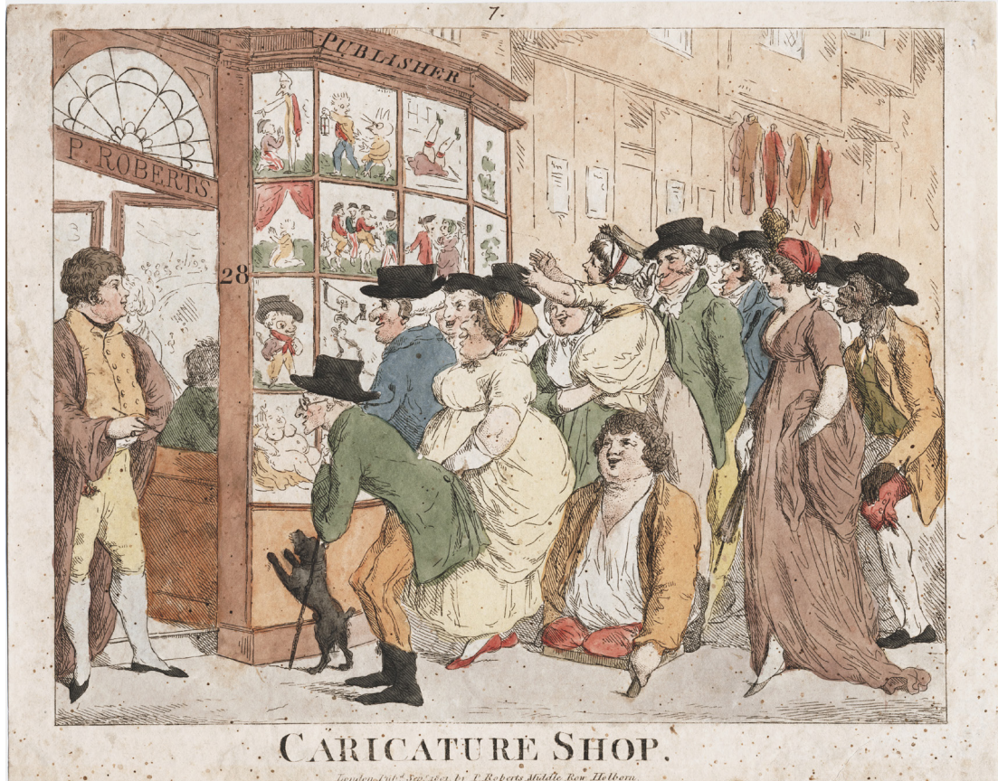
Fig. 4: Published by P. Roberts, Caricature Shop , etching, September 1801.

Alongside contemporary archival documentation, these British satirical prints account for a greater understanding as to the prevalence of caricature prints in everyday life in