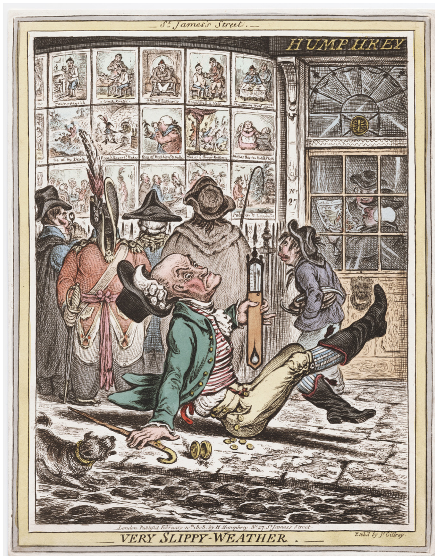
Fig. 3: James Gillray (1756-1815) Very Slippy-Weather, hand-colored etching, 10 February 1808