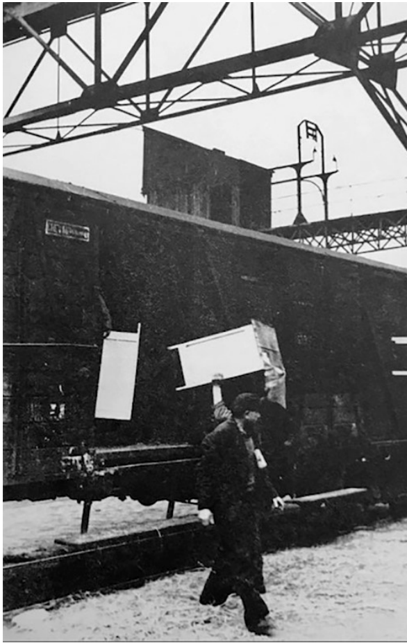
Fig. 1: Anonymous photographer, Furniture loaded onto a rail car at Aubervilliers in order to be shipped to Germany, c. 1943/1944, photography Bundesarchiv, Koblenz, B323/311, fol. 0017

offices in the conquered Eastern territories, these pieces were later used to replenish the contents of bombed-out homes in Western Germany, amongst other purposes. 1