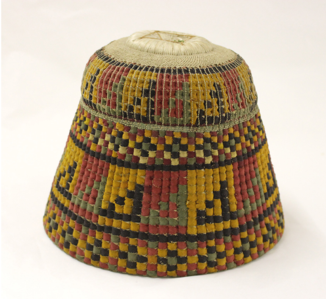
Fig. 3: Hat (meukeutob), Aceh, Northern Sumatra, Indonesia. Purchased from dealer Aalderink, Amsterdam, April 1941. Weltkulturen Museum, Frankfurt am Main (N.S. 33512), photo: Weltkulturen Museum, 2018.

having as much detailed information as possible about the history of an object or a collection from an ethnological perspective. However, the path taken by ethnographical objects towards the art trade is hardly ever documented. Only rarely did early twentieth-century dealers acquire objects directly in the countries of origin. When purchasing them from the European trade themselves, they often received only scant information about regional origin and usage. 31 Historical archives are a possible source, if the galler-