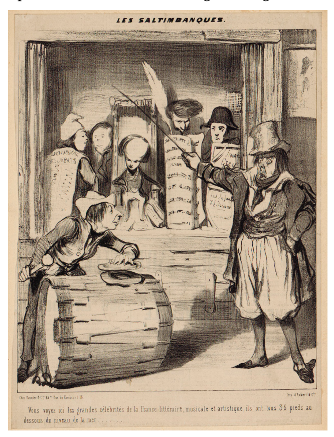
Fig. 2: Honoré Daumier, Les Saltimbanques , Lithographie, 30.5 x 23.5 cm, Paris, Bibliothèque nationale de France, département Musique, ESTMACNUTT026

returned to the subject in the intervening two decades before his death. The work was followed by Napoleon at Fontainebleau (1845) [fig.], Bonaparte Crossing the Alps (1848), and finally his incomplete project, Napoleon at St Helena .<sup>4</sup> In all these works, Delaroche was less concerned with painting a heroic depiction of the ruler than creating a penetrating portrait of Napoleon as a thoughtful, doubt-ridden 'human'.<sup>5</sup> The extent to which these visual similarities had entered public consciousness is evident from a number of cartoons in the contemporary press. Honoré Daumier's Les Saltimbanques appeared in April 1839 in La Caricature magazine [fig.2]. The caption indicates that the group of