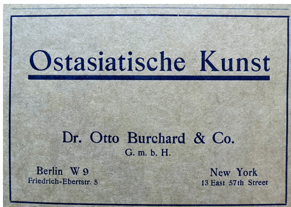
Fig. 7: Advertisement. From: Ostasiatische Zeitschrift , Neue Folge, vol. 7, no. 5 (1931), back inside cover, U III.

of the Tang and Song dynasties, archaic bronze vessels, and bronze fittings of the Siberian nomadic tribes.