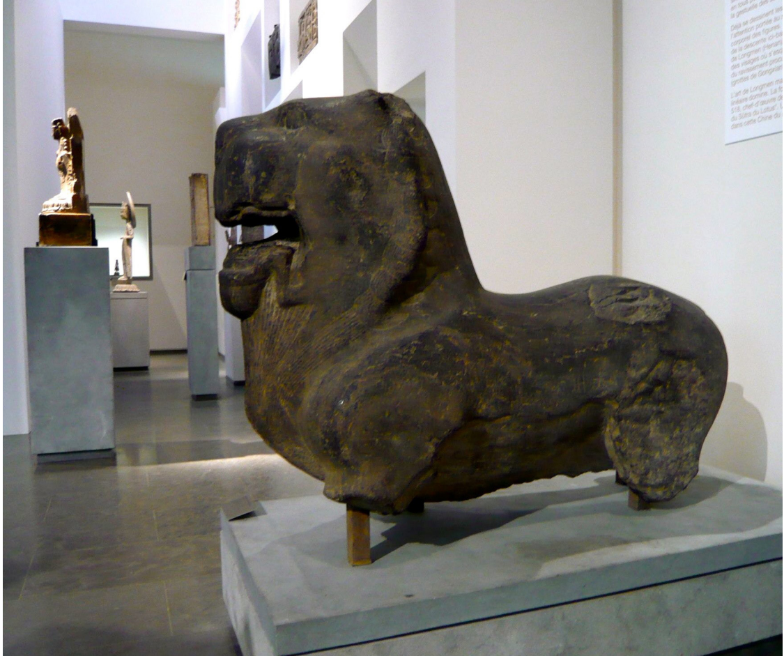
Fig. 5: Monumental lion, China, Northern Henan, 2nd century AD, sandstone, length 135 cm, Paris, Musée Guimet.