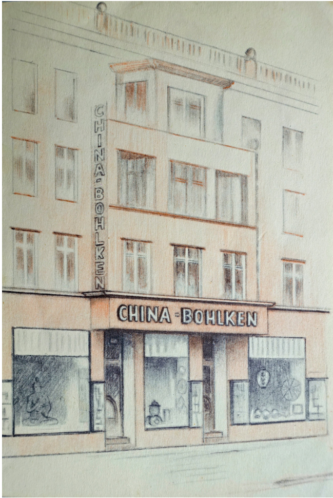
Fig. 2: Flyer with the drawing of the gallery China-Bohlken, Potsdamer Straße 16, Berlin, ca. 1927. Coll. of the author.

published an illustrated brochure giving us a vivid impression of the exhibition areas and the wide range of objects of artistic as well as decorative value.