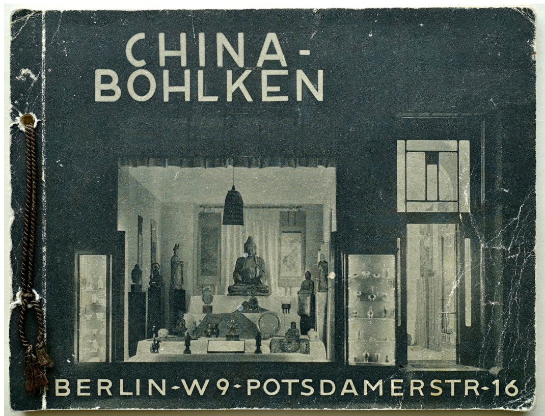
Fig. 10: Brochure “China Bohlken”, ca. 1927.

Photographs by Martha Huth, Waldemar Tietzenthaler and others featuring private homes in interior decoration and architectural magazines as well as the illustrations of home stories in lady's and various other magazines attest to the ubiquity of Chinese works of art on shelves, cupboards, pedestals, walls and gardens. In these pictures we find Tang horses, Han figurines, mounted heads of a Buddha or Bodhisattva, Song dynasty bowls and dishes, Chinese porcelains as well as paintings, usually cut out from the mounting and framed.