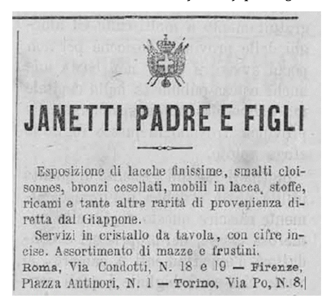
Fig. 4: "Janetti Padre e Figli's adversisement with reference to Japan", in Gazzetta d'Annunzi con agenzia d'affari generali per l'Italia e per l'estero , 22 September 1873, 1 (detail).

tion to the next season's silkworm egg purchases, to be effected by Aymonin in Japan.<sup>31</sup> Following these advertisements, Janetti announced the arrival of lacquerware, cloisonné, bronzes, textiles, etc. directly from Japan (fig. 4).<sup>32</sup>