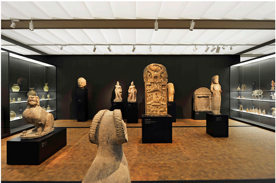
Fig. 4: View of part of the permanent exhibition of Chinese Art at the Museum Rietberg