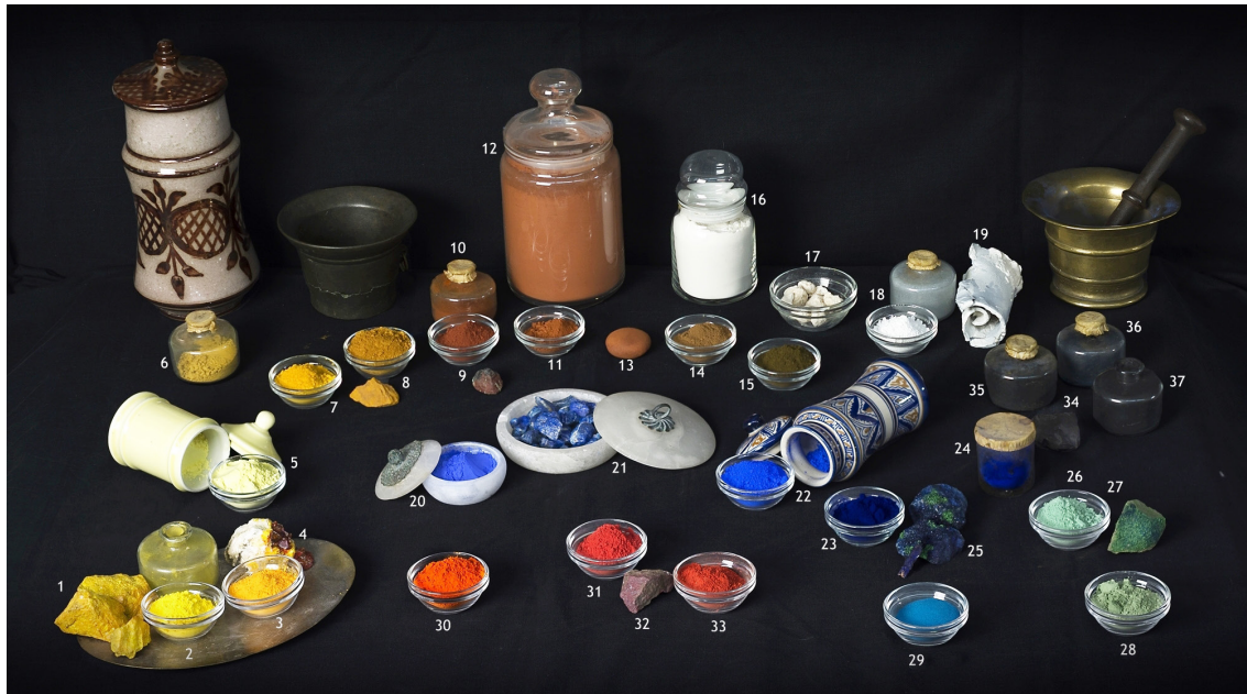
Fig. 1: The main mineral pigments available in the sixteenth century in the Hispanic Empire. 1-2 orpiment; 3-4 realgar; 5 lead-tin yellow; massicot (litharge); 7 yellow ocher; 8 Siena earth; 9-11 red-earth; 12 almagra; 13 gilding clay; 14 roasted Siena earth; 15 umber earth ; 16-17 calcium carbonate; 18 white lead; 19 lead roll covered with lead carbonate; 20 ultramarine; 21 lapis lazuli; 22 smalt; 23-25 azurite; 25 chrysocolla; 26-27 malachite; 28 green earth from Verona; 29 verdigris; 30 minium; 31 vermilion; 32 cinnabar mineral from Almadén; 33 cinnabar; 34 asphalt; 35 black earth; 36 smoke black; 37 chacoal black.

To a lesser extent, commerce also became a two-way exchange. In the same way that some pictorial and artistic materials were imported from America or Asia to Spain, others were shipped to those distant ports. Indeed, Seville commonly dealt in artists' materials to send to America, for example. But not only those that were unavailable overseas were exported: even those which could be found in America were shipped from Spain as if the colors issued from Castile were a guarantee of quality. 12 Given the complex mercantile landscape, it is necessary to inspect the pigments or colorants involved in detail to understand specific aspects of production, in addition to trade movements related to the peninsular context, offering a concise yet somewhat detailed analysis for each one (Figs. 1-4).