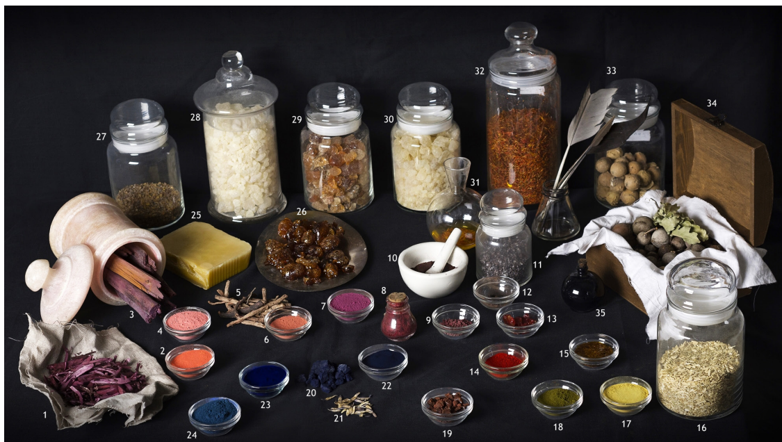
Fig. 3: The main lakes, dyes and other organic substances available in the sixteenth century in the Hispanic Empire. 1 Shavings of Brazil; 2 Brazil lake; 3 Campeche wood; 4 pink lake; 5 madder roots; 6 madder lake; 7 cochineal crimson; 8 Florence Crimson; 9 Spanish Crimson; 10 American cochineal powder; 11 American cochineal; 12; Grain; 13 lac-dye; 14 lac-dye lake; 15 shellac; 16 weld; 17 weld lake; 18 sap-green; 19 dragons-blood; 20 pieces of woad; 21 woad seeds; 22 woad powder; 23 Indigo from Iran; 24 American indigo; 25 wax; 26 fruit gum; 27 amber; 28 mastic resin; 29 gum Arabic; 30 colophony; 31 saffron in solution; 32 safflower; 33-34 oak galls; 35 ink.

often underestimated. 37 Unlike the developments with regard to pigments, the discovery of America and the new Asian routes had a decisive impact on international trade (Figures 3-4).