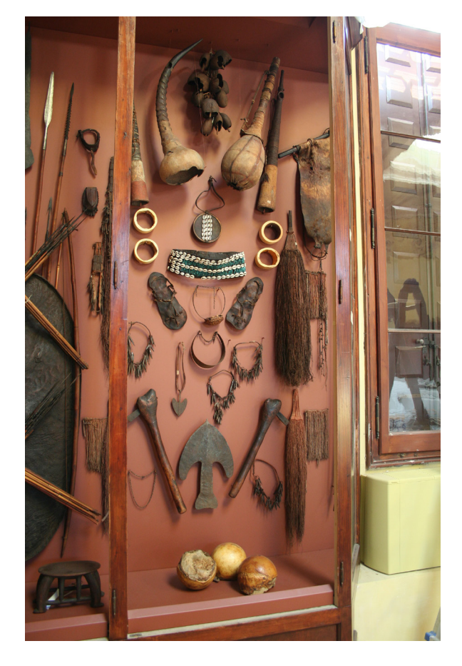
Fig: 2. The 'Madi Case' in the Giovani Miani gallery (2018).

musical instruments [and clothes from the women of the village], for they knew that I wanted to make a collection."<sup>32</sup> He later states, "it was only possible to obtain these objects after the war with the Madi, in which the king was killed."<sup>33</sup> He did not try to disguise the source of these objects, but celebrated their violent process of acquisition: the focal part of his arrangement of his collection included two leopard skins and two head rests taken from the Madi raid.<sup>34</sup>